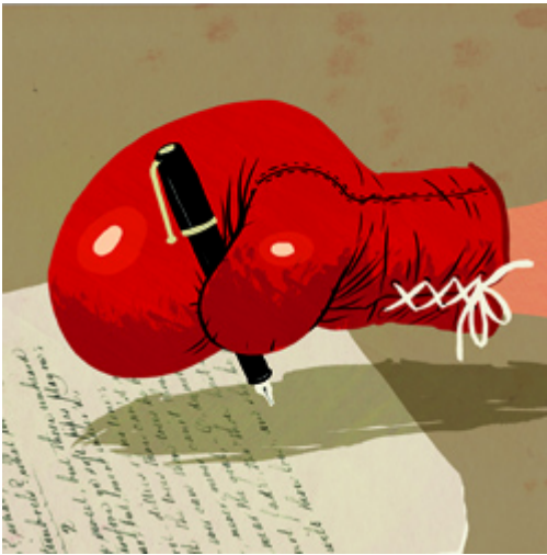
Novel Award Entry